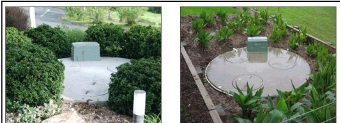
These home owners have landscaped around the treatment tank.